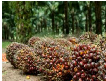
Fresh Fruit Bunches