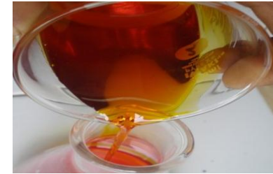
Crude Palm Oil