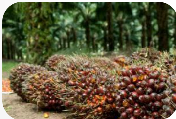
Fresh Fruit Bunches