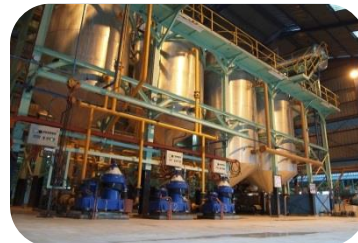
Palm Oil mill