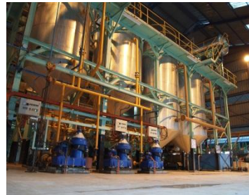
Palm Oil mill